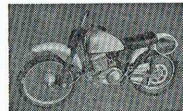
250cc Challenger 24MXI

Suzuki Honda Ariel B.S.A. Lambretta Vespa etc. Reliant & Bond Threewheelers