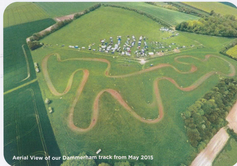
Aerial View of our Dammerham track from May 2015