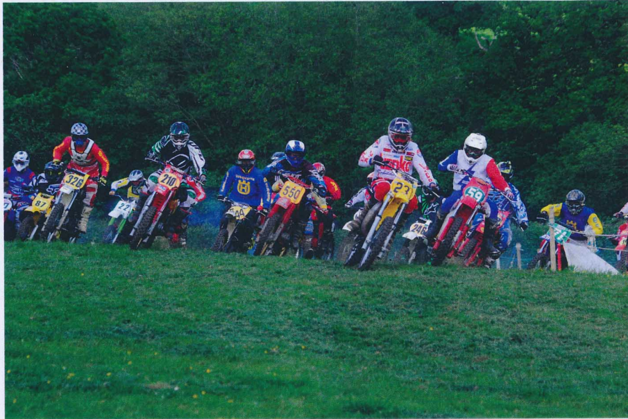
First corner action

For those new to our sport a little explanation may help you enjoy your day.