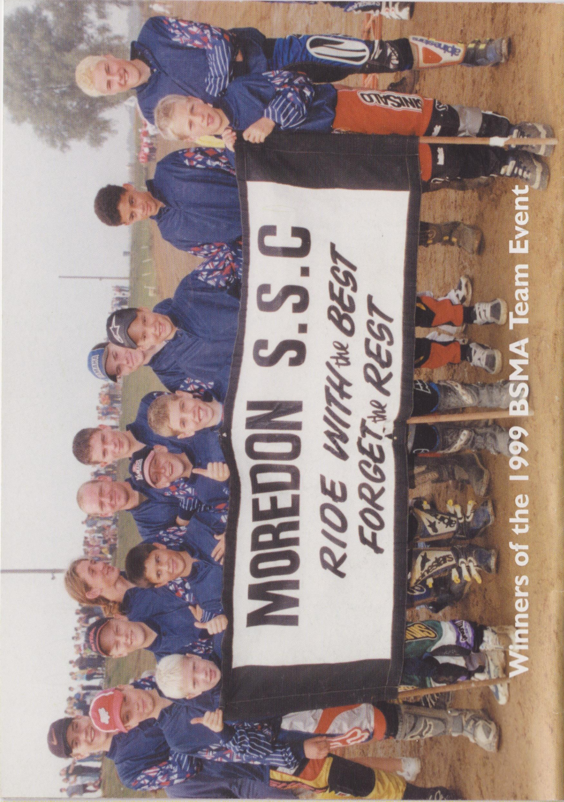
Winners of the 1999 BSMA Team Event

Moredon Moto-X-Club incorporating A.M.X PRESENTS