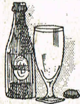
the best PALE! 'Green Tops'