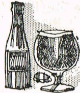
the best STRONG! 'Crabbers Nip'