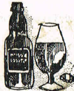
the best BROWN!