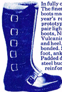
RED DEVIL MODEL 7406 MARK II

Outstanding value for money. 2 1/2 mm Full Chrome English Ox hide, six stout straps and buckles. Sponge padded front for skin protection. Smart toe shape. Sleek 'Moto-Cross' slipper sole of 'Nitrile' Directly Vulcanised to upper. Sponge padded cuff at top of leg. 'Terylene' lock-stitched throughout.