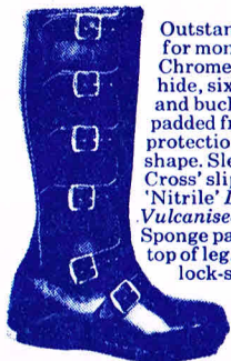
DODINGTON MODEL 7403

Outstanding value for money. 2 1/2 mm Full Chrome English Ox hide, six stout straps and buckles. Sponge padded front for skin protection. Smart toe shape. Sleek 'Moto-Cross' slipper sole of 'Nitrile' Directly Vulcanised to upper. Sponge padded cuff at top of leg. 'Terylene' lock-stitched throughout.