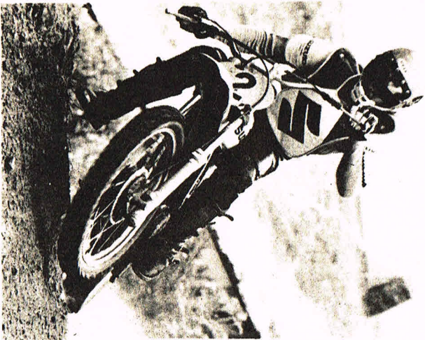
Roger de Coster 1975 500cc World Champion