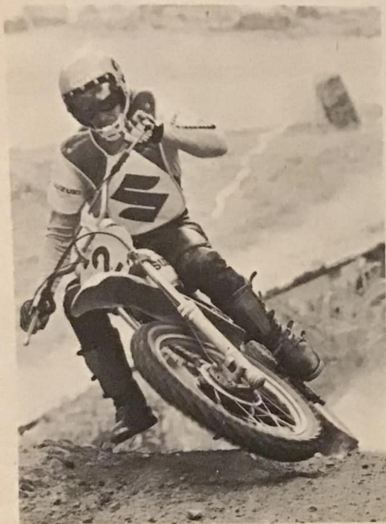
Roger de Coster 1975 500cc World Champion