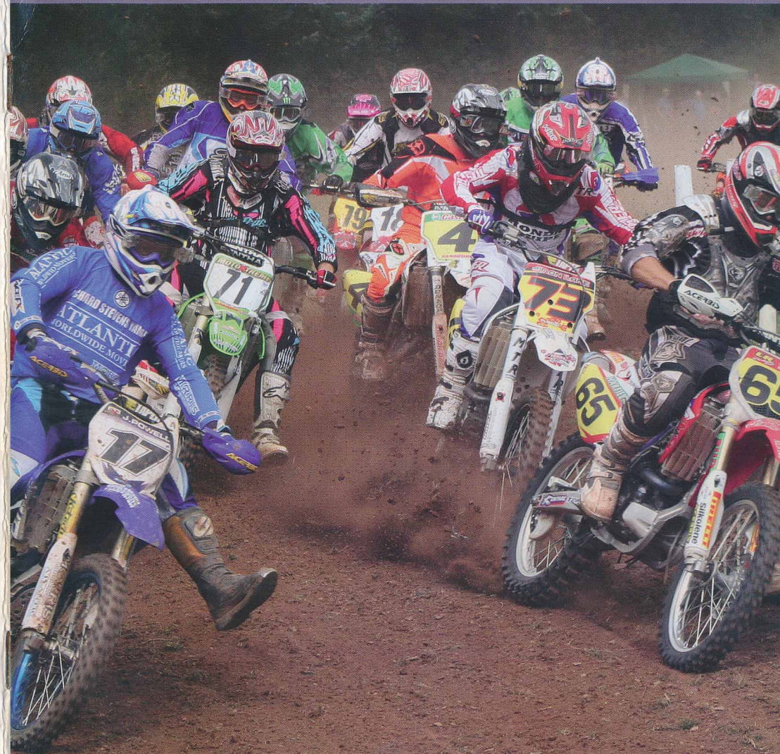
AMCA Open Championship. Walterstone.