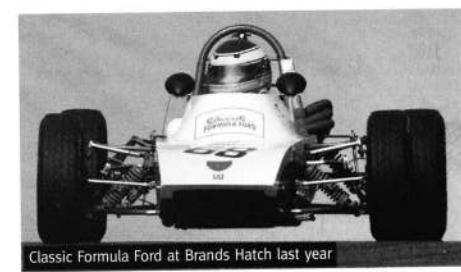
Classic Formula Ford at Brands Hatch last year