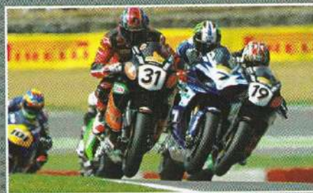
BSB remains one of the biggest draws in Kent