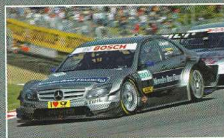
DTM – the fastest touring cars in the world

For tickets and more information: 0870 950 9000 brandshatch.co.uk