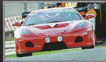
Britcar GT in association with Mackinnon Construction