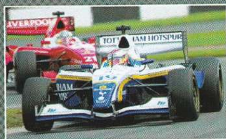
Motorsport + football = Superleague Formula