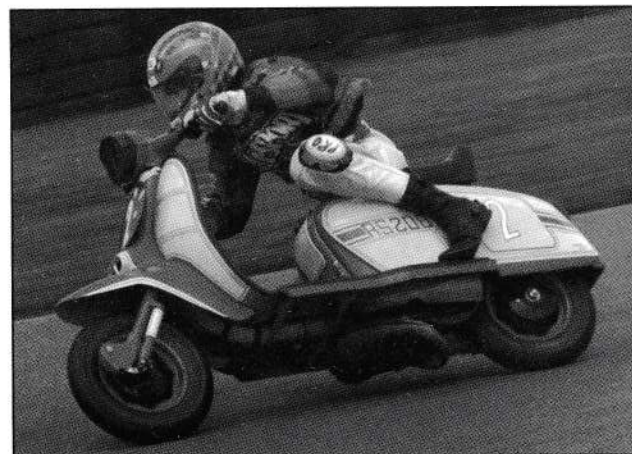
"Scooter Racings latest heart-throb is Doncasters Ryan Saxelby. Here he is in action at Mallory Park in May. Any young ladies interested - please form an orderly queue!"

All in all you can expect some close exciting racing and watch as lap records tumble due to the freshly re-surfaced track!