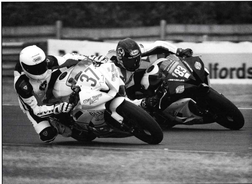
Hunt & Buchan

Brands Hatch hosts the 10th round of the BMCRC-MRO Championship for 2009, this is the final visit of the year to a MSV circuit and with only Thruxton and Lydden remaining all classes are reaching boiling point.