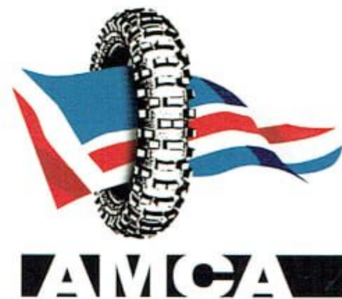
1967 Beenham Park, "Mudhole"