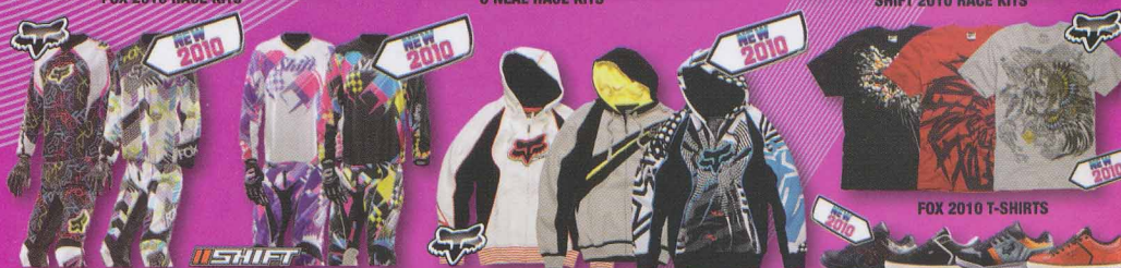
LADIES FOX 2010 RACE KITS