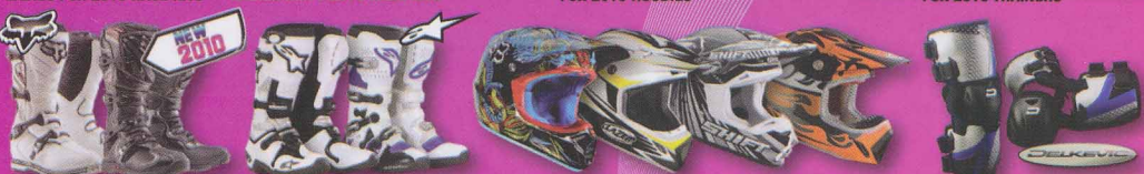
FOX 2010 RACE BOOTS