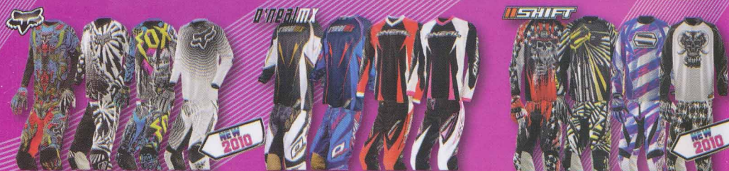
FOX 2010 RACE KITS

FOR ALL THE BEST PRICES ON CLOTHING, PARTS AND ACCESSORIES CALL 01782 338738 OR VISIT US AT WWW.DKOFFROAD.CO.UK