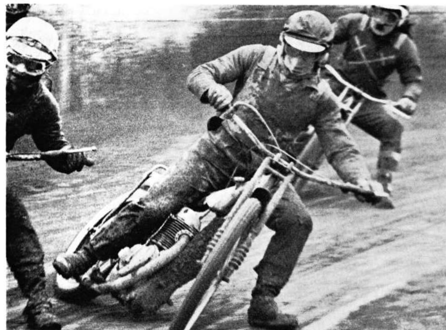
Hurricane Hubbard scores a "max" and Broke Track Record.