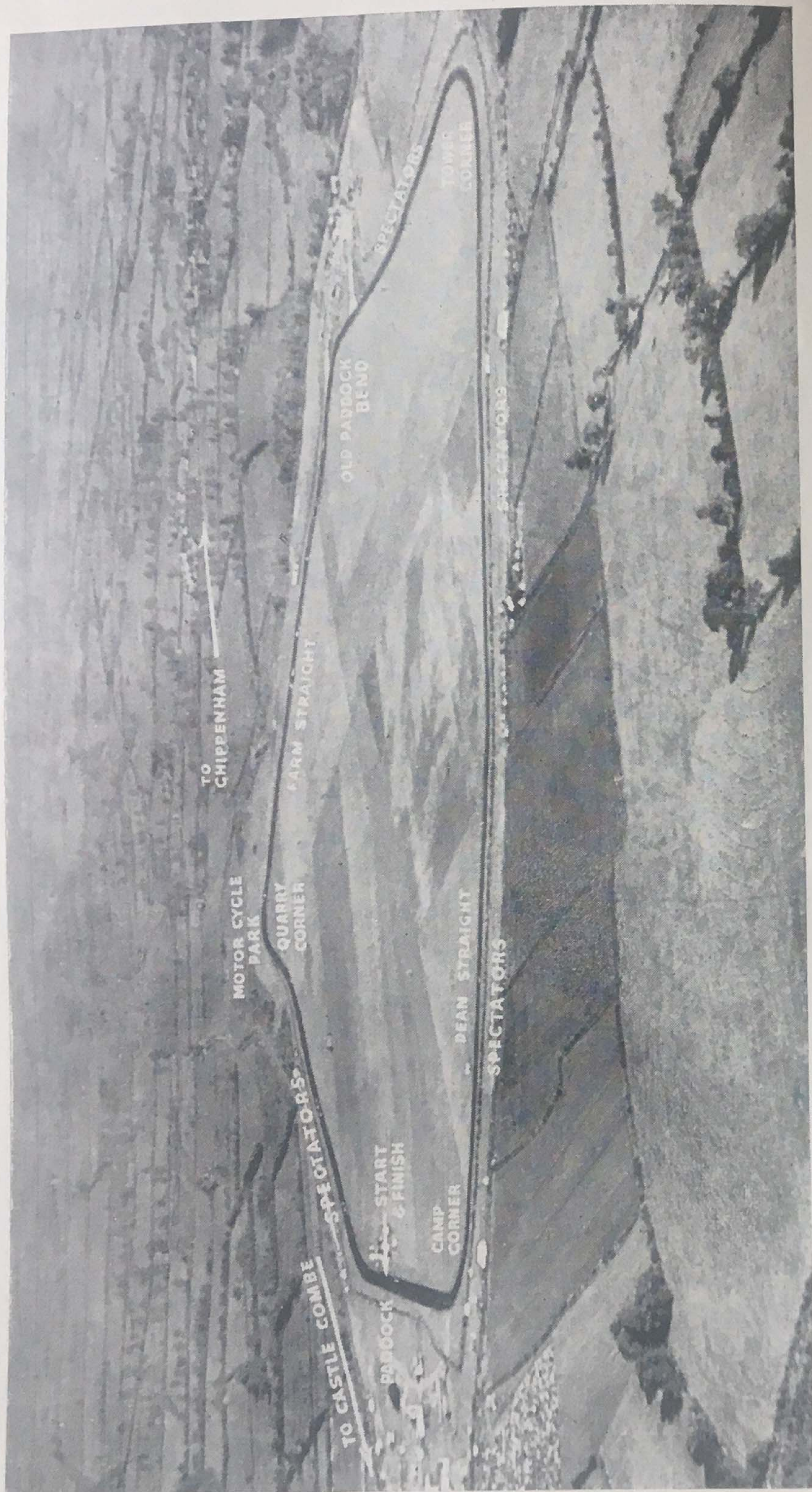
Aerial view of the Track.