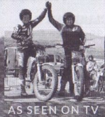
AS SEEN ON TV