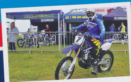
I learnt loads and loved every minute...