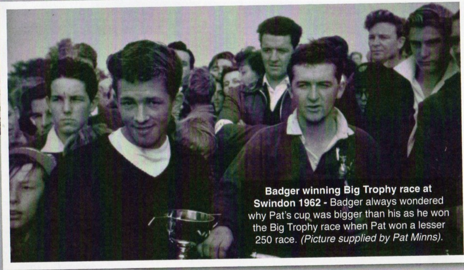
Badger winning Big Trophy race at Swindon 1962 - Badger always wondered why Pat's cup was bigger than his as he won the Big Trophy race when Pat won a lesser 250 race. (Picture supplied by Pat Minns).