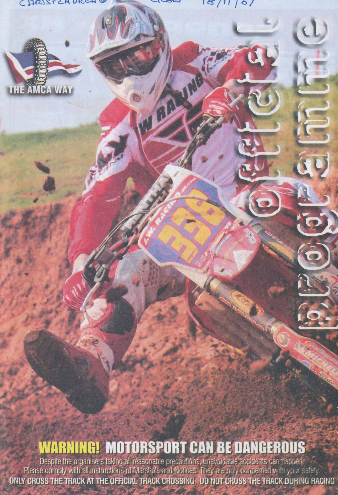
AMCA Championship, Nympsfield October 2006