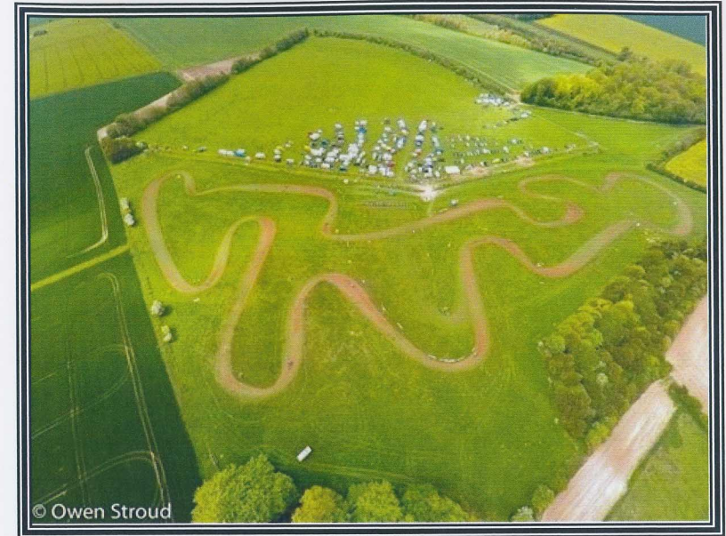
Aerial View of our Damerham track from May 2015