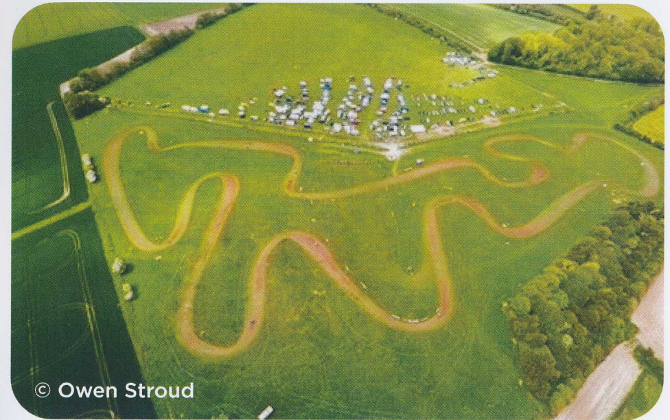
Aerial View of our Damerham track from May 2015