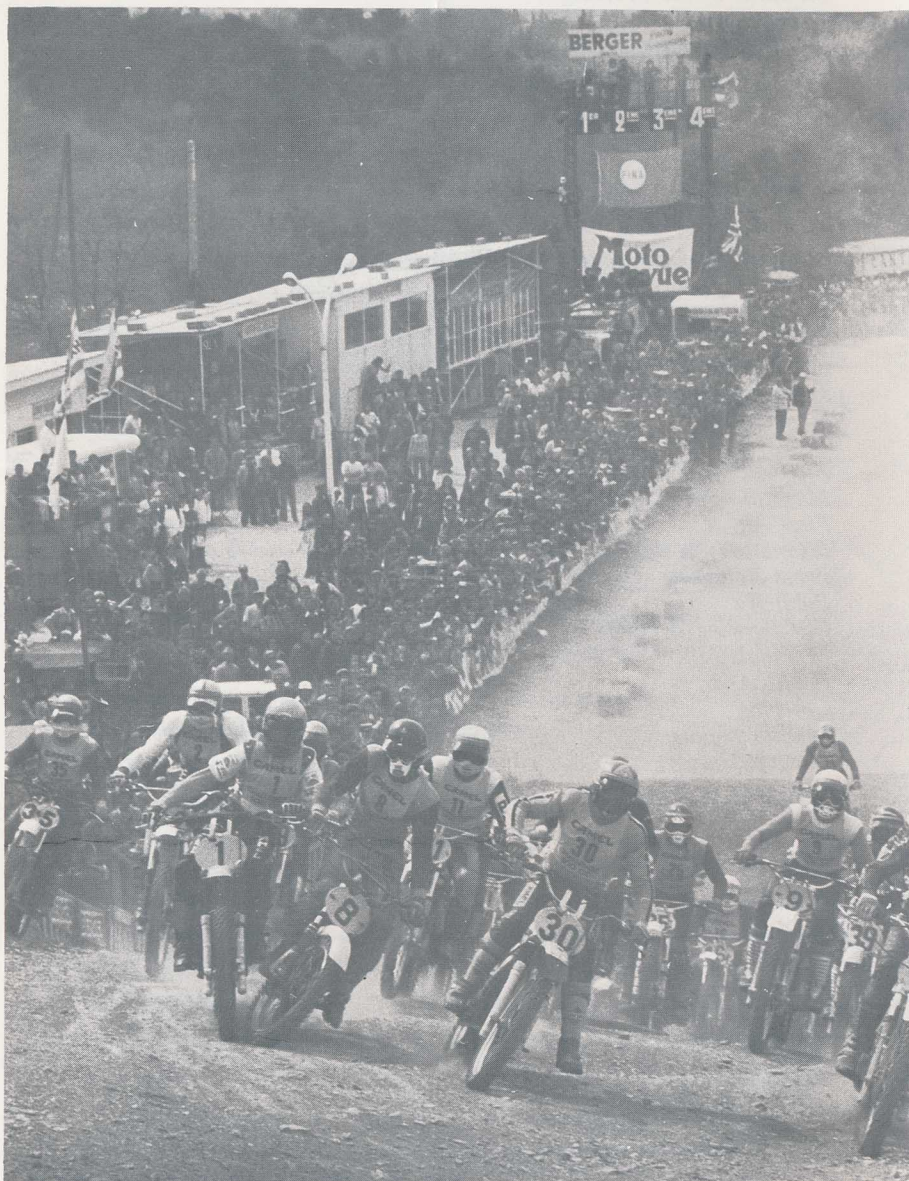
French Grand Prix—Roger de Coster, No. 1; A. Lindfors, No. 8