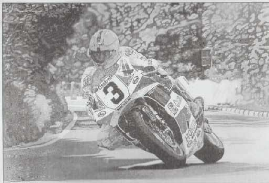
'A day in June' Joey Dunlop Honda RC45 IoM TT 1995