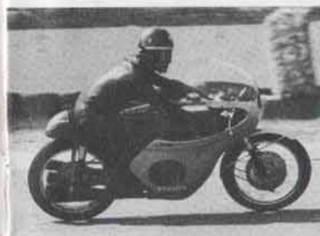
Luigi Taveri, the Swiss rider, is to ride a 125 cc Honda-S. Taveri was 125 World Champion in 1962, 1964 and 1966.