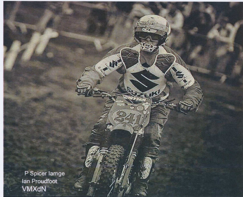
P Spicer Iamge Ian Proudfoot VMXdN