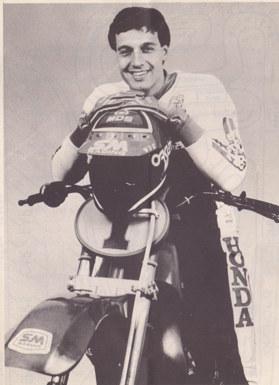
1983 EARLYBIRDS WINNER