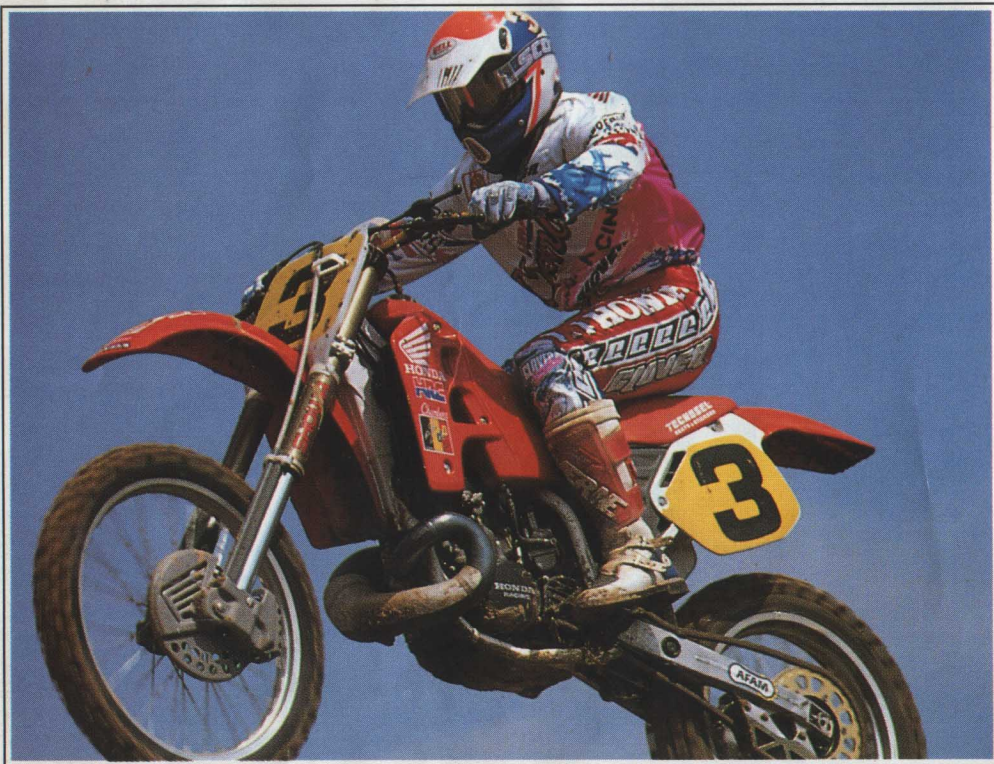
Eric Geboers: World 500cc Motocross Champion.