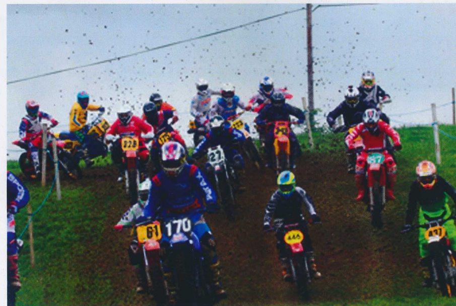
Younguns on a charge