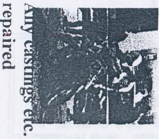
Any casings etc. repaired