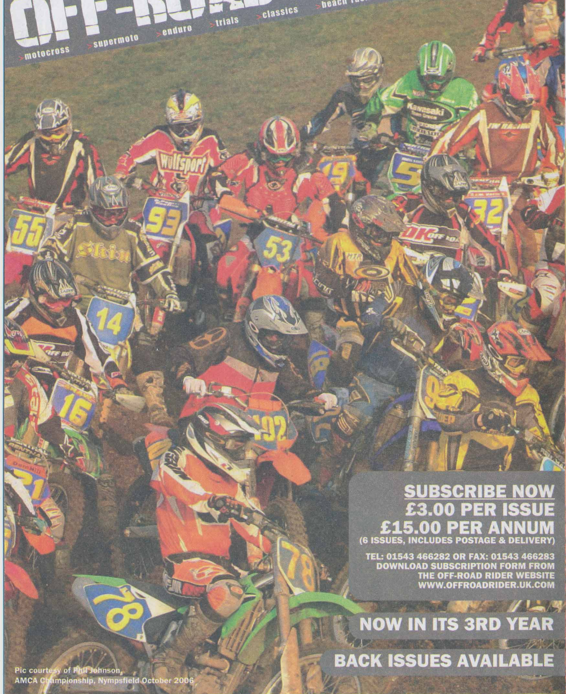
AMCA Championship, Nympsfield October 2006

> motocross > supermoto > enduro > trials > classics > beach racing > motoduro