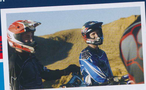
I learnt loads and loved every minute...