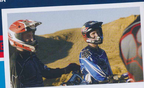
I learnt loads and loved every minute...