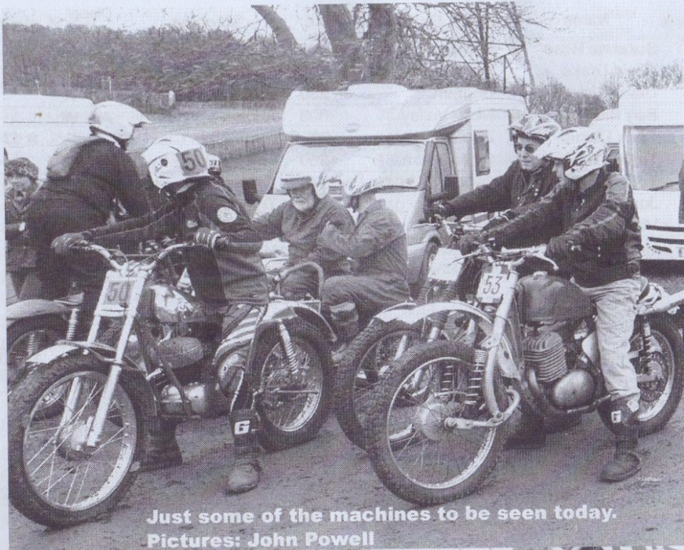
Just some of the machines to be seen today.