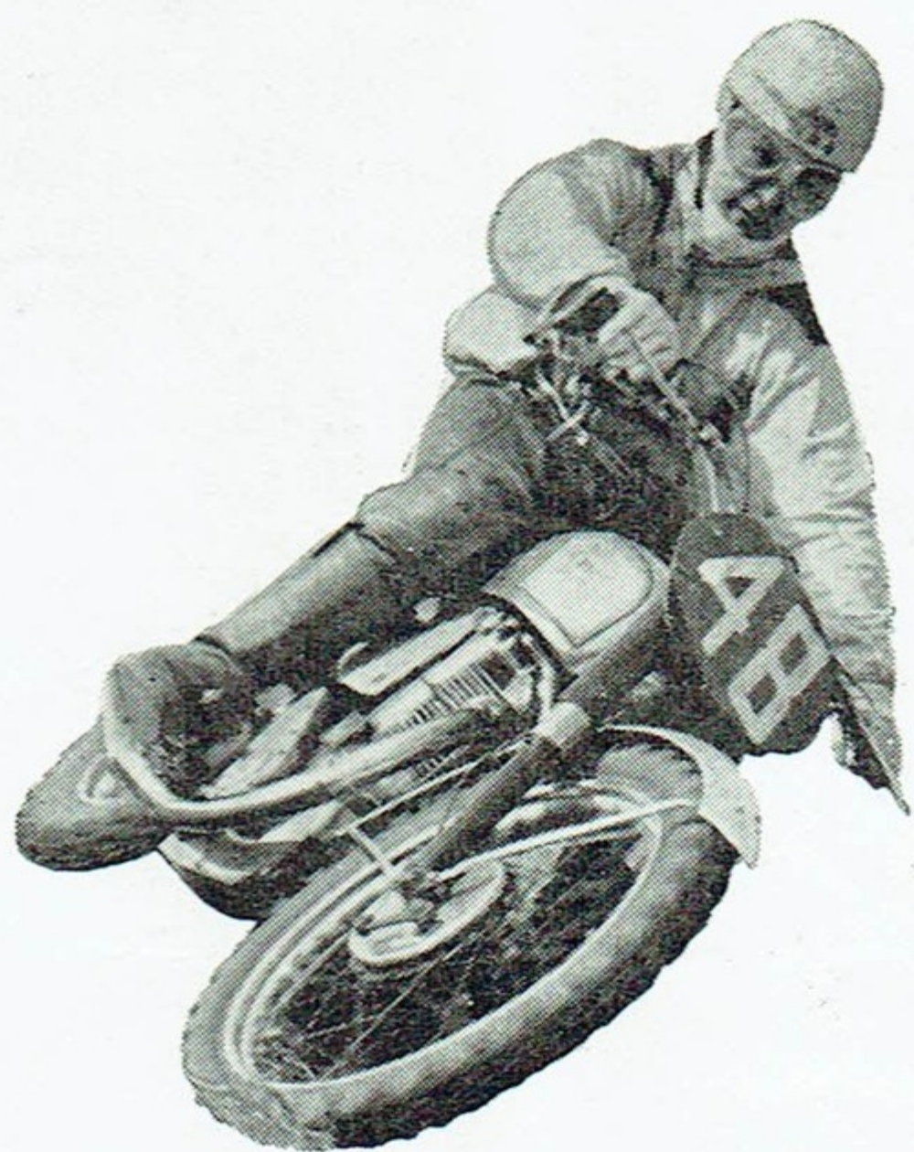
1952 British Scrambles Champion