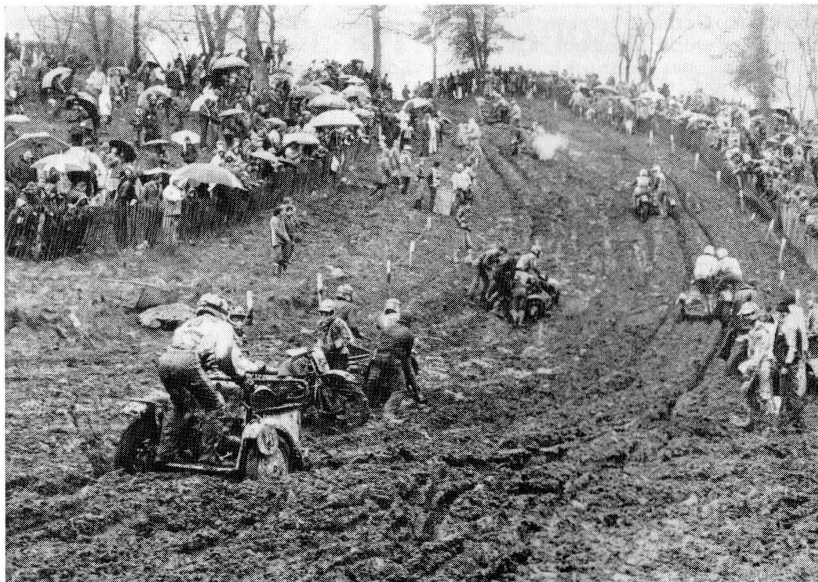
REMEMBER LAST YEAR?

DANGER: H.M. Govt. Health Depts'. WARNING SMOKING MAY COST YOU MORE THAN MONEY