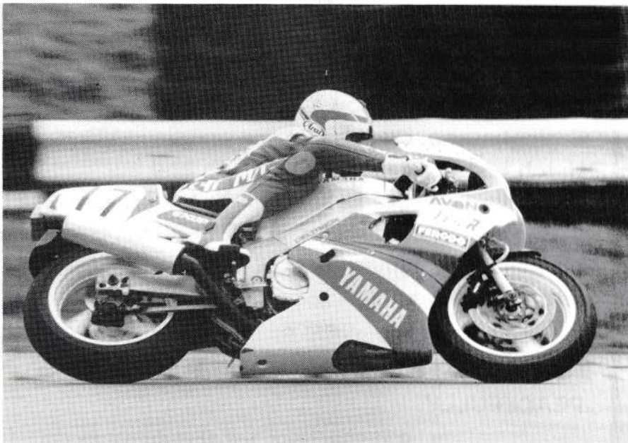
The all-action style of Gary Weston.