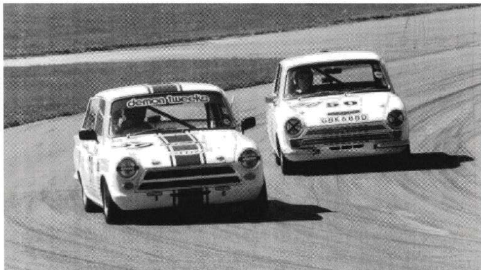
Lotus Cortinas always provide spectacular racing.