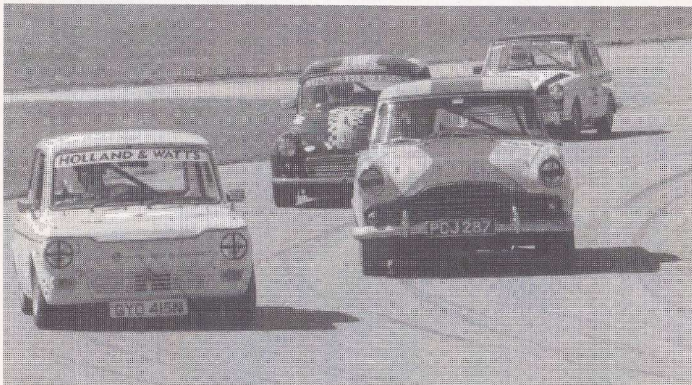
A Classic Collection at the Devil's Elbow last year.