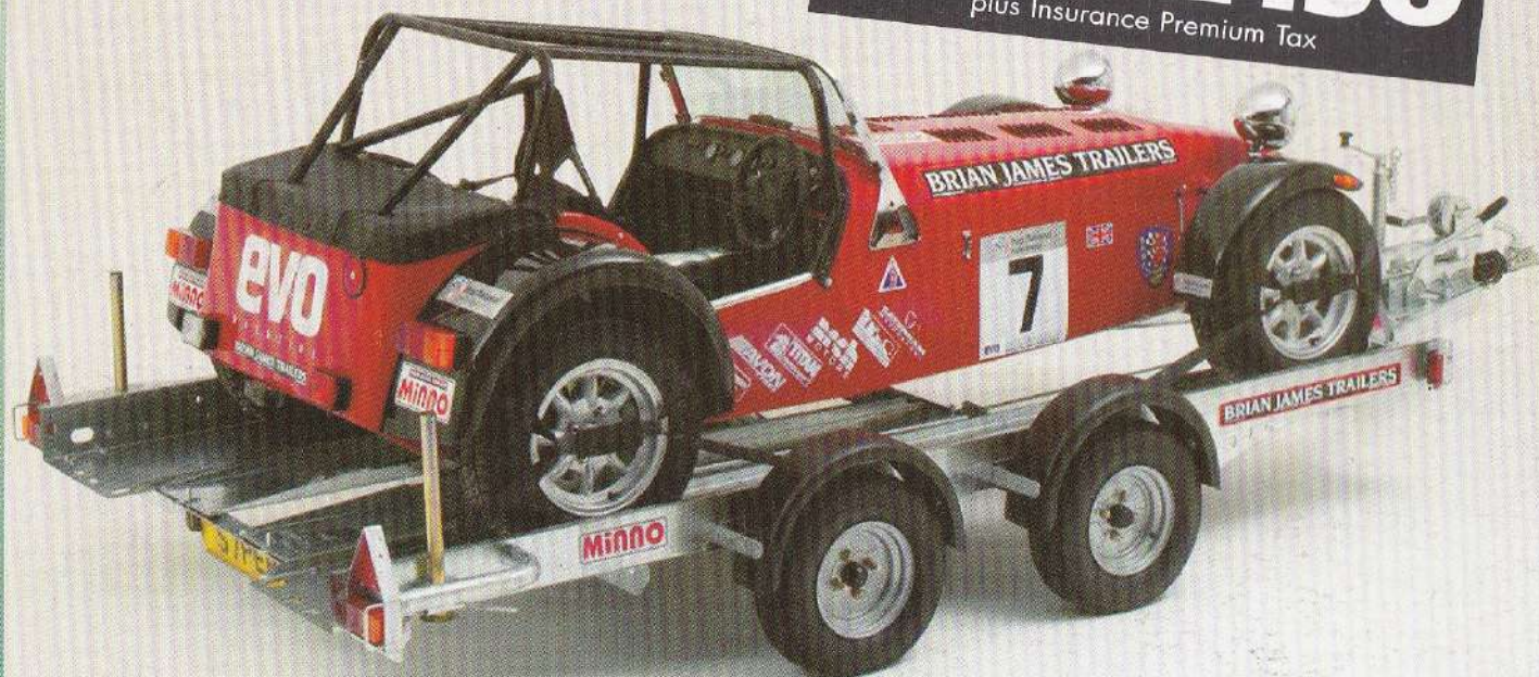
Brian James Trailers - supplier to 750 Club members