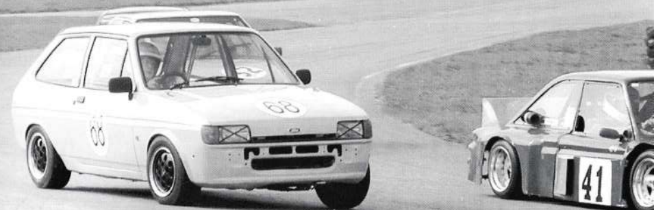
Jack Brann (68)

The BSW Intermediate Saloon & Sports Car Championship is for saloon and hatchback cars retaining the original engine block and head. There are restrictions on what can be changed with regard to both mechanical components and bodywork. The class structure caters for cars running on slicks or 'road going' cars using normal road tyres. There is also provision for the inclusion of forced induction saloons and classes are again structured to recognise the power advantage these cars may have. There are however restrictions on the type of turbo unit and intercooler the cars can use. Additionally, to equalise power and traction advantages four wheel drive cars can only run on road tyres. As with the sports car championship, points are awarded according to a competitors class finishing position, not overall position, so there is plenty of chance for some of the smaller less powerful cars to compete for the overall championship honours. Bill Richards' built a mini especially for this championship in 2000 and took the overall championship honours that year by a very close margin. Last year the winner was Warren Johnson in a Peugeot 206 and of course there are a whole range of powerful Cosworth powered cars that will be fighting to lead the race.