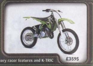
Factory racer features and K-TRIC £3595