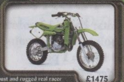
Robust and rugged real racer £1475