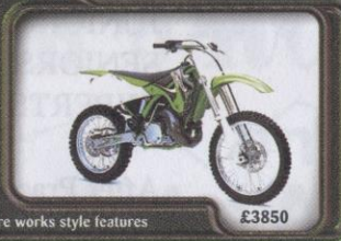
More works style features £3850