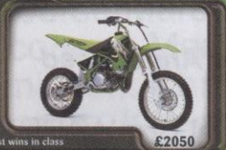
Most wins in class £2050