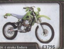
Lightweight 4 stroke Enduro £3795