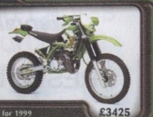
New to UK for 1999 £3425