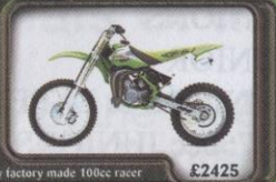
Only factory made 100cc racer £2425