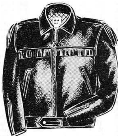
Victory Leather Jacket with fringe £12 10 0