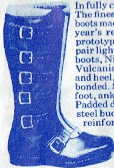
RED DEVIL MODEL 7406 MARK II

Outstanding value for money. 2 1/2 mm Full Chrome English Ox hide, six stout straps and buckles. Sponge padded front for skin protection. Smart toe shape. Sleek 'Moto-Cross' slipper sole of 'Nitrile' Directly Vulcanised to upper. Sponge padded cuff at top of leg. 'Terylene' lock-stitched throughout.