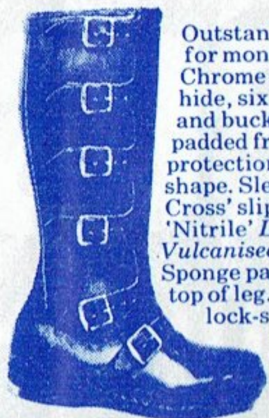
DODINGTON MODEL 7403

Outstanding value for money. 2 1/2 mm Full Chrome English Ox hide, six stout straps and buckles. Sponge padded front for skin protection. Smart toe shape. Sleek 'Moto-Cross' slipper sole of 'Nitrile' Directly Vulcanised to upper. Sponge padded cuff at top of leg. 'Terylene' lock-stitched throughout.