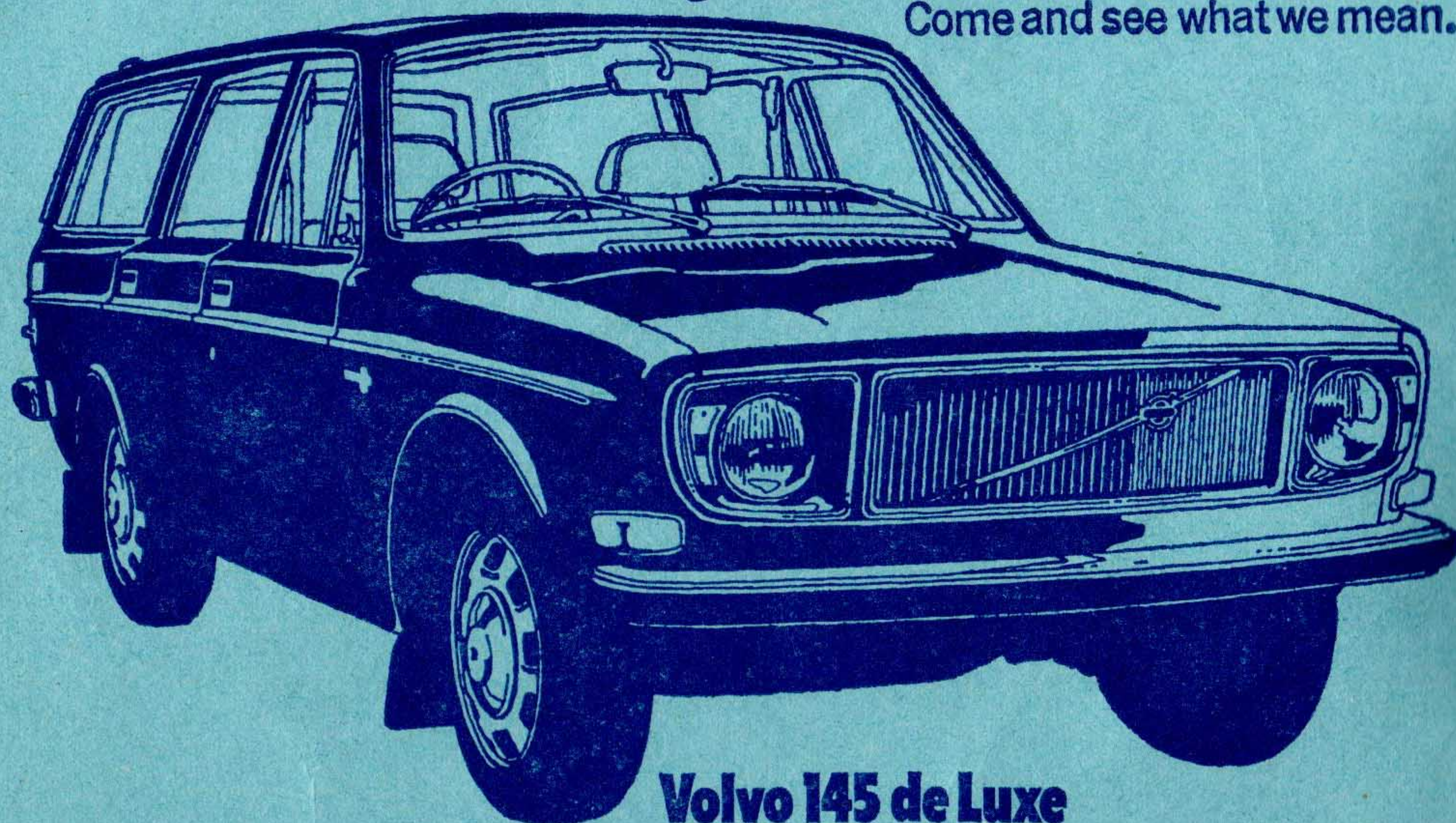
Volvo 145 de Luxe

believe in giving as much attention to the little things as they do to the rest of the car which no doubt accounts for their quality and reliability. It also explains why we had to go through very stringent tests before being appointed as Volvo dealers - to ensure that your Volvo gets the after-sales care it deserves. Come and see what we mean.