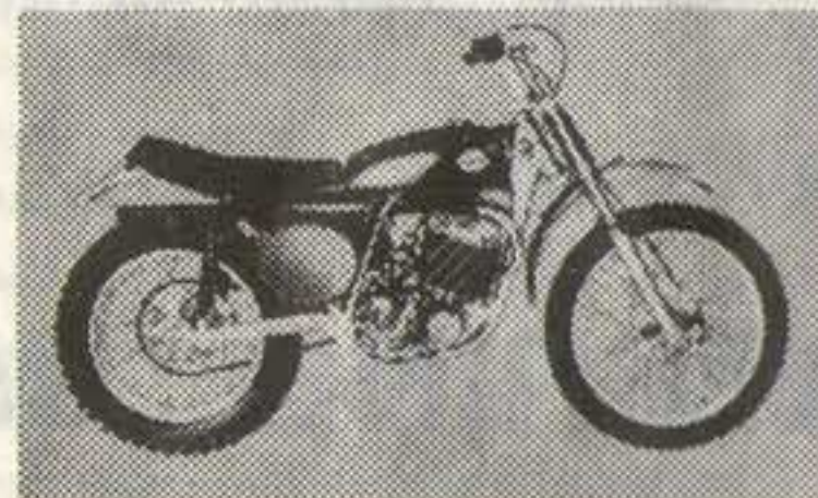
380cc 'Griffon' Moto Cross Model 58