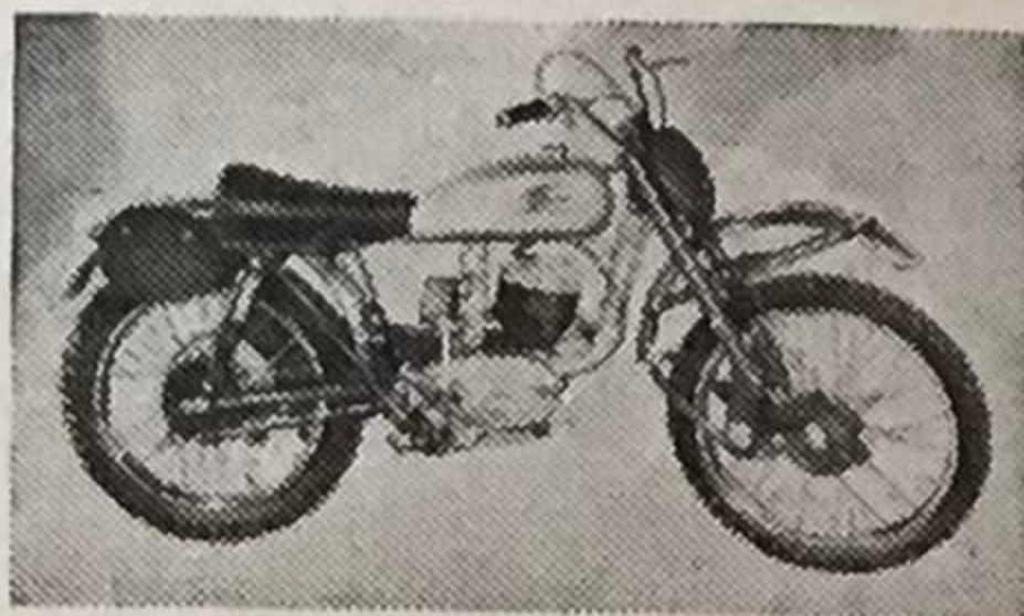
250 cc Hawkstone Special 24SCS