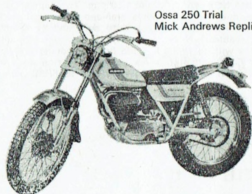
Ossa 250 Trial Mick Andrews Replica