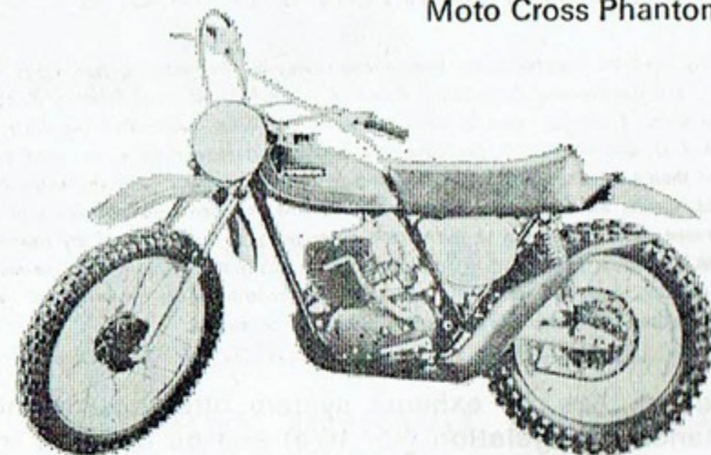
Ossa 250 Moto Cross Phantom

For further details or Technical Information consult the Concessionaires: