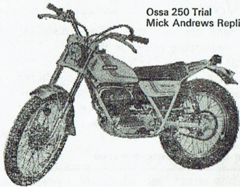
Ossa 250 Trial Mick Andrews Replica